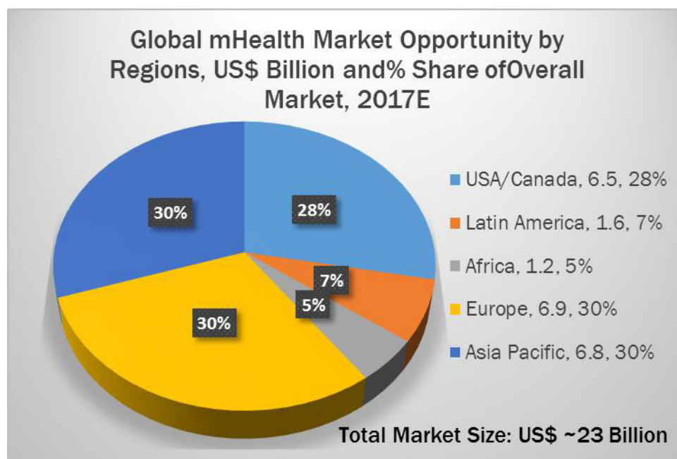
Figure 2: Global mHealth Market Overview