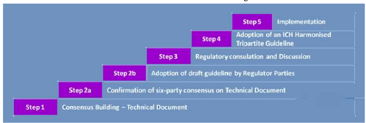
Figure 2: ICH Formal Procedure

The maintenance procedure is currently applicable only for alterations to the Q3C Guideline on Impurities: Residual Solvents. In each case the process is used when there is new information to be added or the technical content is no longer valid.