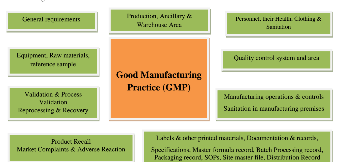
Figure 2. Combined components of GMP