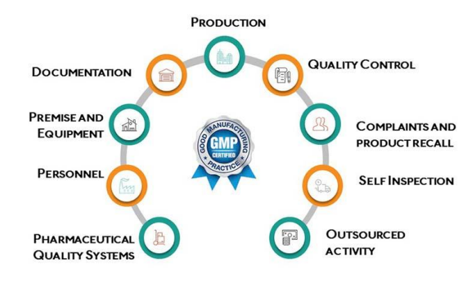
Figure 4. GMP requirement for herbal medicines in India

analysis. Because of this, a suitable quality assurance system should be used in the production of herbal medications.